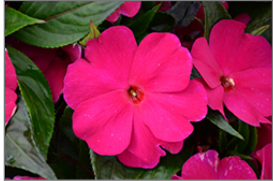
Magnum Purple New Guinea Impatiens flowers

Magnum Purple New Guinea Impatiens is recommended for the following landscape applications;