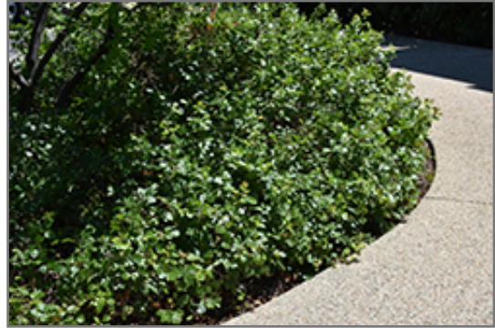
Gro-Low Fragrant Sumac

Gro-Low Fragrant Sumac is recommended for the following landscape applications;