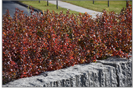
Gro-Low Fragrant Sumac in fall

This shrub performs well in both full sun and full shade. It is very adaptable to both dry and moist locations, and should do just fine under typical garden conditions. It is not particular as to soil type, but has a definite preference for acidic soils, and is subject to chlorosis (yellowing) of the foliage in alkaline soils. It is highly tolerant of urban pollution and will even thrive in inner city environments. Consider applying a thick mulch around the root zone in winter to protect it in exposed locations or colder microclimates. This is a selection of a native North American species.