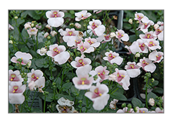
Juliet Pink with Eye Twinspur flowers

A cool weather, compact and upright series that features mounds of green pointy foliage covered in brightly colored pea-like flowers; excellent performance in containers, hanging baskets or garden beds