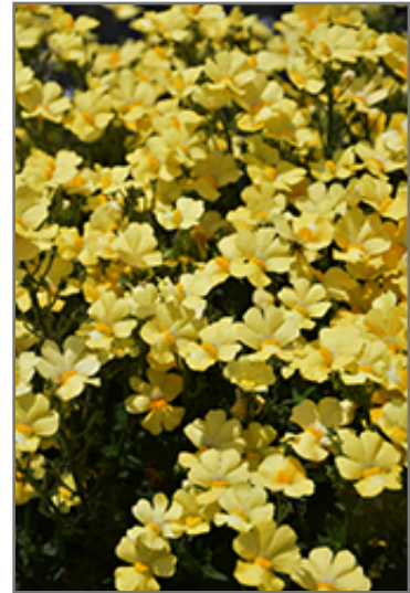
Sunsatia Lemon Nemesia flowers