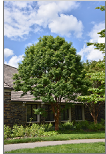
Paperbark Maple