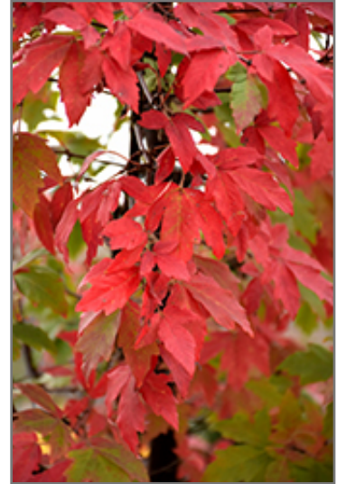
Paperbark Maple in fall

This tree does best in full sun to partial shade. It prefers to grow in average to moist conditions, and shouldn't be allowed to dry out. It is not particular as to soil type or pH. It is somewhat tolerant of urban pollution. This species is not originally from North America.