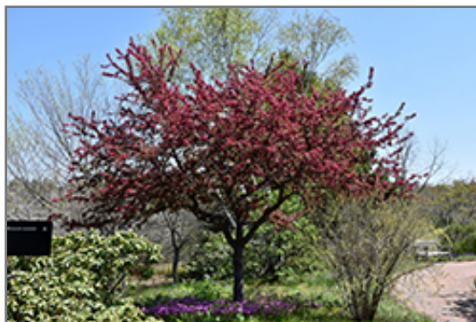
Adams Flowering Crab in bloom