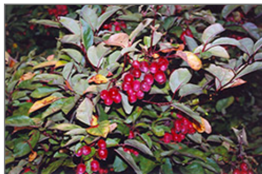
Adams Flowering Crab fruit