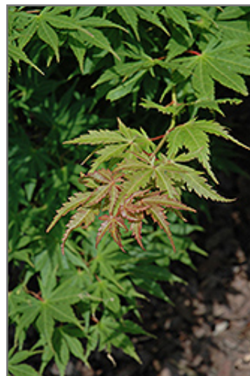
Yellow Bird Japanese Maple foliage