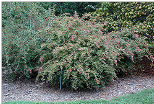
Edward Goucher Abelia in bloom