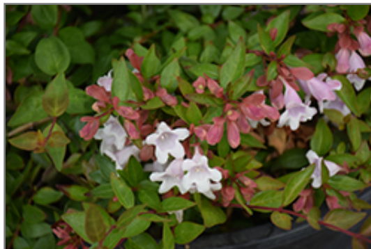
Edward Goucher Abelia flowers

Edward Goucher Abelia is recommended for the following landscape applications;