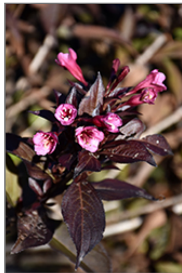
Fine Wine Weigela flowers