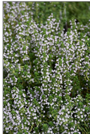
Doone Valley Thyme flowers

Doone Valley Thyme is recommended for the following landscape applications;