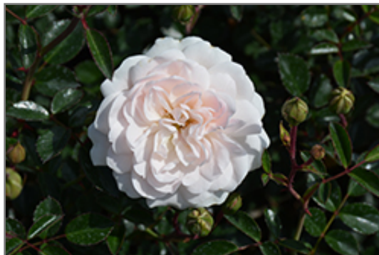
Sea Foam Rose flowers

Sea Foam Rose is recommended for the following landscape applications;