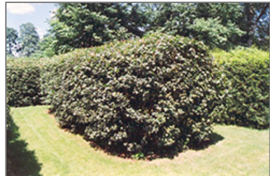
Hedge Maple