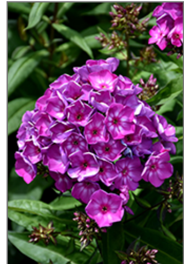
Grape Lollipop Garden Phlox flowers

Grape Lollipop Garden Phlox is recommended for the following landscape applications;