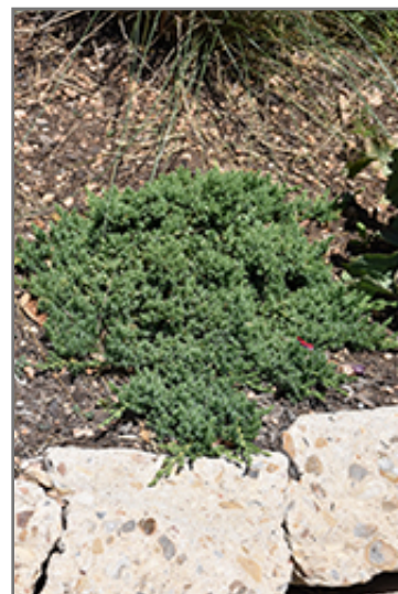
Green Mound Dwarf Japanese Juniper