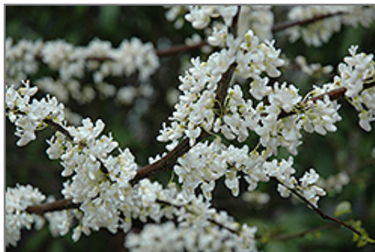
White Redbud flowers