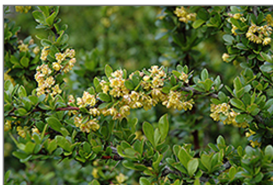
Sparkle Japanese Barberry flowers