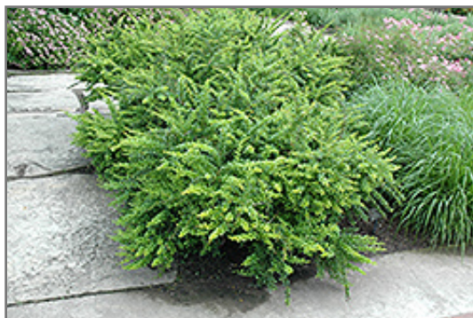
Sparkle Japanese Barberry