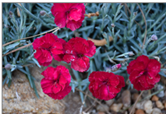
Frosty Fire Pinks flowers