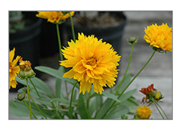
Sunray Tickseed flowers

Compact plant with double daisy-like yellow flowers; tolerant of pests and drier soils; thriving in sandy and rocky soils; compact habit is great for pots; coreopsis needs good drainage