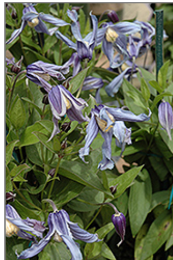
Caerulea Solitary Clematis flowers

Caerulea Solitary Clematis is recommended for the following landscape applications;