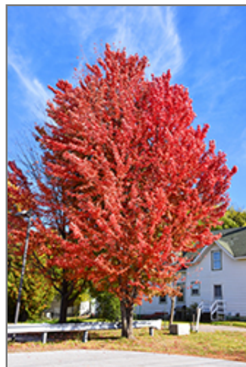
Celebration Maple in fall