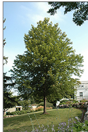
Celebration Maple