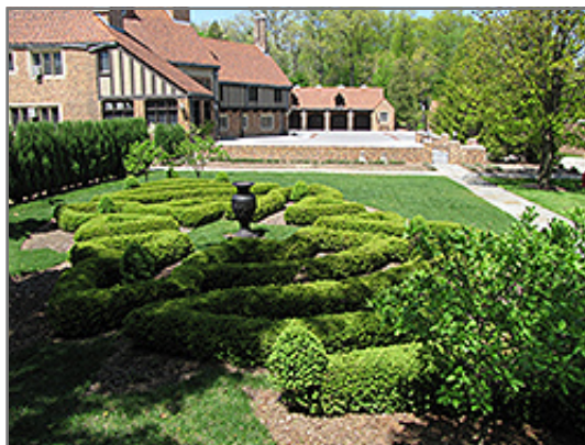
Compact Korean Boxwood

Compact Korean Boxwood makes a fine choice for the outdoor landscape, but it is also well-suited for use in outdoor pots and containers. It is often used as a 'filler' in the 'spiller-thriller-filler' container combination, providing the canvas against which the thriller plants stand out. Note that when grown in a container, it may not perform exactly as indicated on the tag - this is to be expected. Also note that when growing plants in outdoor containers and baskets, they may require more frequent waterings than they would in the yard or garden.