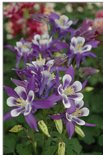
Winky Blue And White Columbine flowers

Winky Blue And White Columbine is recommended for the following landscape applications;