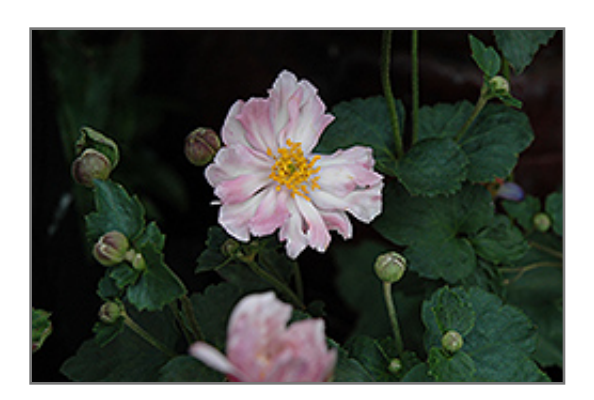
Queen Charlotte Anemone flowers

Soft-pink semi-double buttercup flowers rise high above dark green foliage; windflowers are perfect for naturalizing, swaying gently in the wind and blooming at the end of the season