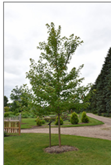
Matador Maple