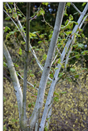
Joe Witt Snakebark Maple bark