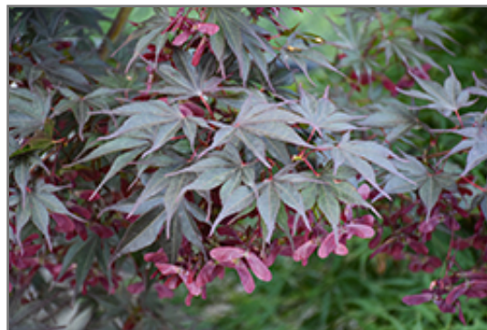
Red Dawn Full Moon Maple foliage