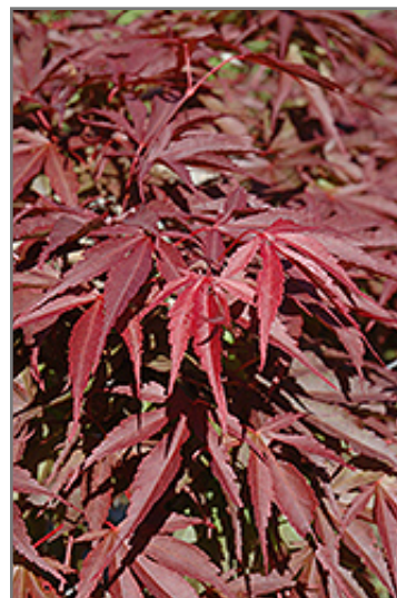
Red Dawn Full Moon Maple foliage Photo courtesy of NetPS Plant Finder