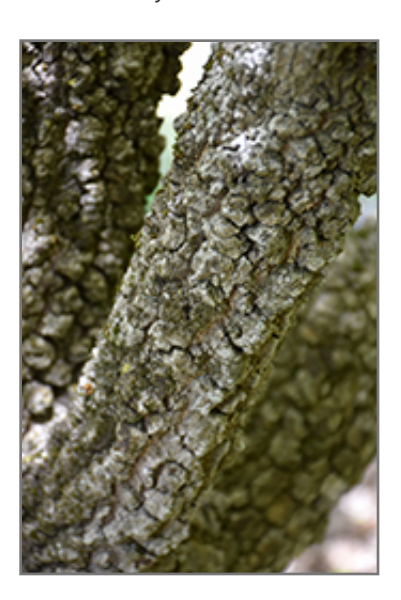
Pinebark Japanese Maple bark