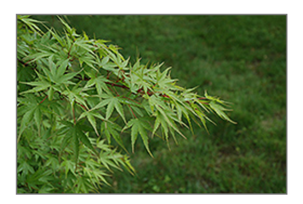
Pinebark Japanese Maple foliage

Pinebark Japanese Maple will grow to be about 15 feet tall at maturity, with a spread of 15 feet. It has a low canopy with a typical clearance of 2 feet from the ground, and is suitable for planting under power lines. It grows at a slow rate, and under ideal conditions can be expected to live for 60 years or more.