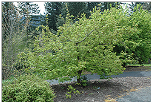
Monroe Vine Maple in bloom