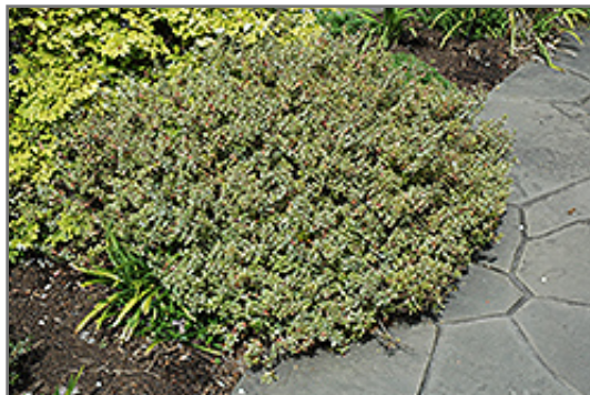
Silver Anniversary Glossy Abelia

Silver Anniversary Glossy Abelia is recommended for the following landscape applications;