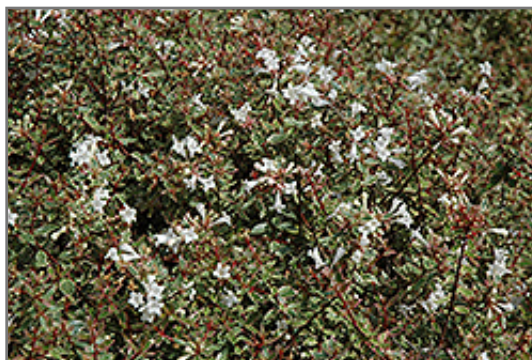
Silver Anniversary Glossy Abelia flowers