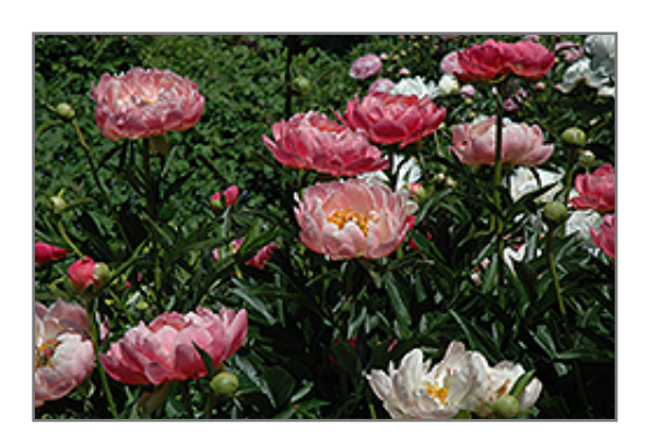
Coral Charm Peony flowers

Coral Charm Peony will grow to be about 30 inches tall at maturity, with a spread of 3 feet. When grown in masses or used as a bedding plant, individual plants should be spaced approximately 30 inches apart. The flower stalks can be weak and so it may require staking in exposed sites or excessively rich soils. It grows at a slow rate, and under ideal conditions can be expected to live for approximately 20 years. As an herbaceous perennial, this plant will usually die back to the crown each winter, and will regrow from the base each spring. Be careful not to disturb the crown in late winter when it may not be readily seen!