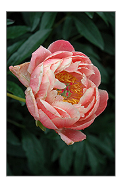
Coral Charm Peony flowers