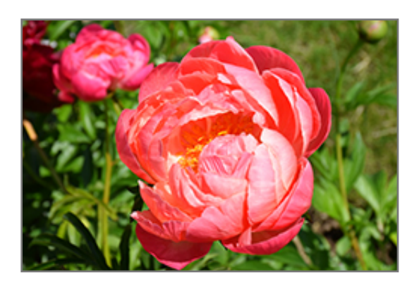
Coral Charm Peony flowers