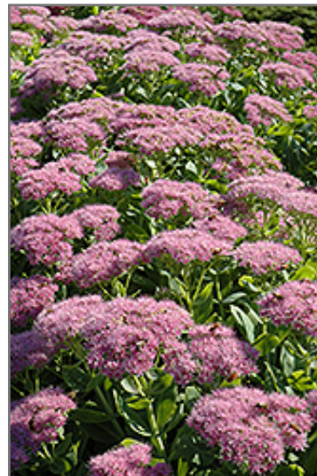
Brilliant Stonecrop flowers