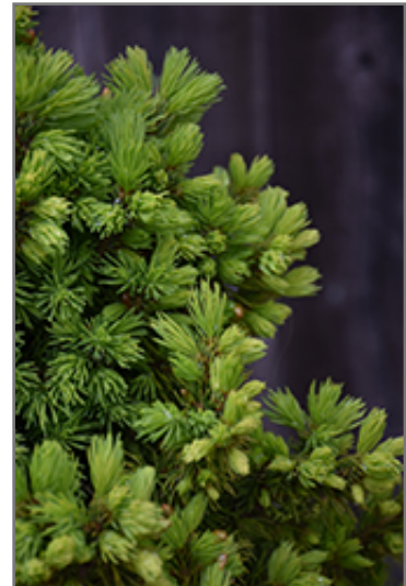
Rainbow's End Spruce foliage

* This is a 'special order' plant - contact store for details