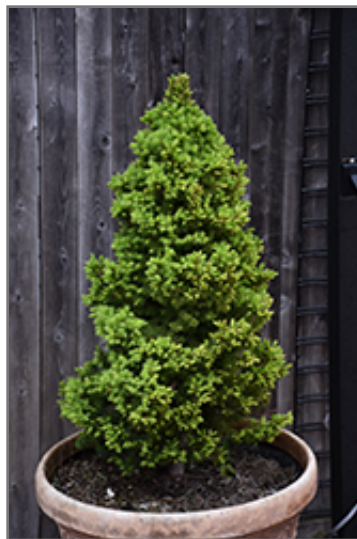
Rainbow's End Spruce