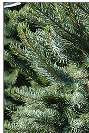
Brun's Spruce foliage