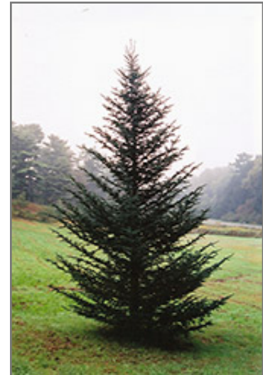
Fraser Fir

Fraser Fir will grow to be about 35 feet tall at maturity, with a spread of 20 feet. It has a low canopy, and should not be planted underneath power lines. It grows at a slow rate, and under ideal conditions can be expected to live for 70 years or more.