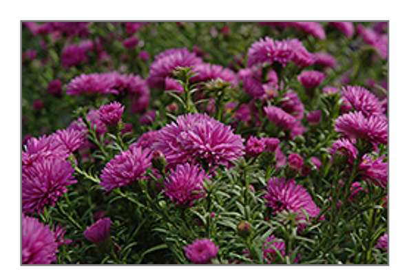
Frolic Aster flowers

Compact, bushy plant with a profusion of dark rose-blue double flowers and attractive lance-like green leaves; prefers cool, moist soil; water the root zone instead of from the top to reduce fungal disease; water regularly to encourgage more blooms