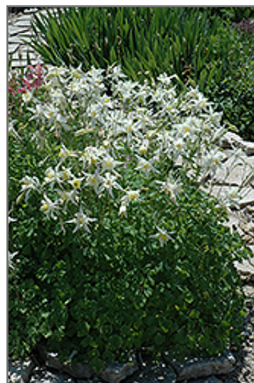
Kristall Columbine in bloom