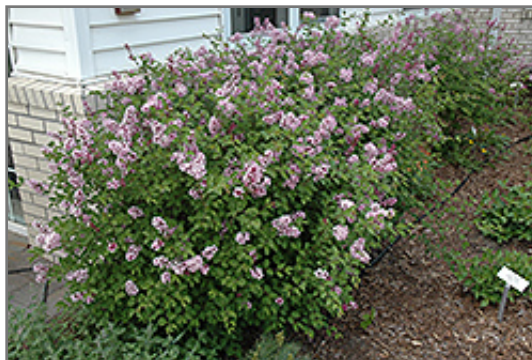
Prince Charming Lilac in bloom