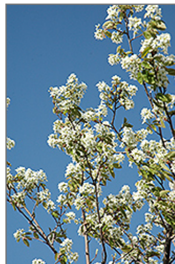
Allegheny Serviceberry flowers