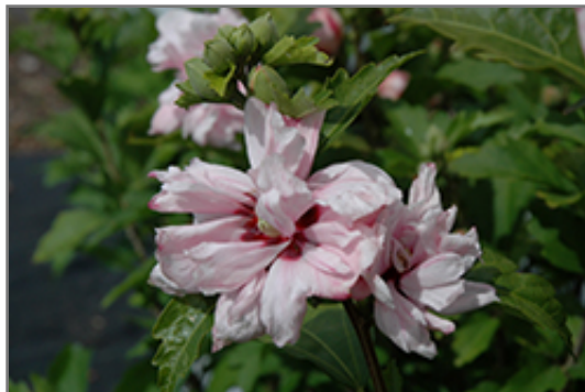
Blushing Bride Rose Of Sharon flowers