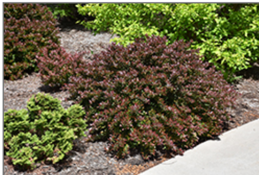
Concorde Japanese Barberry

Concorde Japanese Barberry is recommended for the following landscape applications;