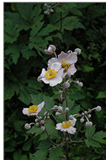
Grapeleaf Anemone flowers