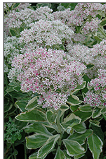
Frosty Morn Stonecrop flowers