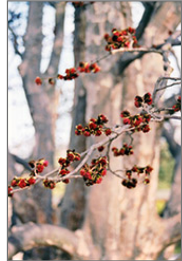
Persian Parrotia flowers

This tree should only be grown in full sunlight. It is very adaptable to both dry and moist locations, and should do just fine under average home landscape conditions. It is not particular as to soil type or pH. It is highly tolerant of urban pollution and will even thrive in inner city environments. This species is not originally from North America.