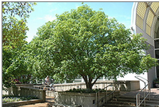
Purpleblow Maple

Purpleblow Maple will grow to be about 20 feet tall at maturity, with a spread of 15 feet. It has a low canopy with a typical clearance of 4 feet from the ground, and is suitable for planting under power lines. It grows at a slow rate, and under ideal conditions can be expected to live for 70 years or more.