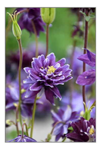
Christa Barlow Columbine flowers