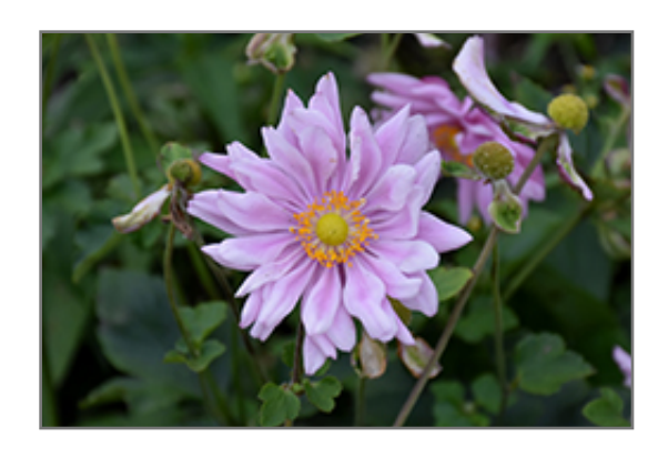
Alice Anemone flowers

Light pink semi-double buttercup flowers rise above dark green foliage on this compact selection; windflowers are perfect for naturalizing, swaying gently in the wind and blooming at the end of the season; should not need to be staked