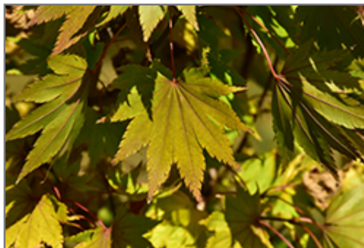
Jordan Full Moon Maple foliage