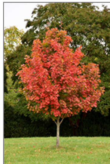
John Pair Sugar Maple in fall