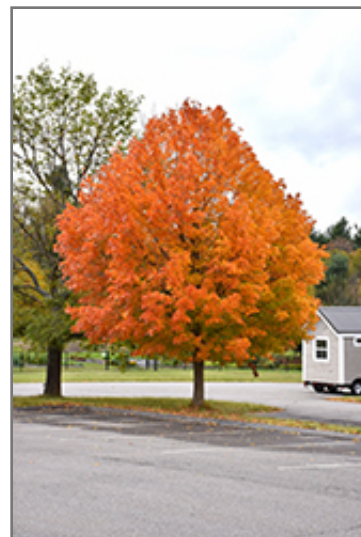
Sugar Maple in fall