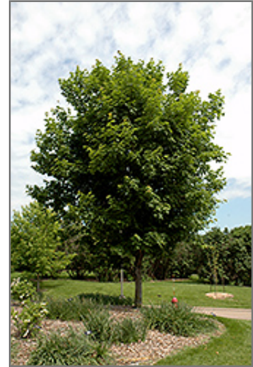
Sugar Maple

This tree should only be grown in full sunlight. It prefers to grow in average to moist conditions, and shouldn't be allowed to dry out. It is not particular as to soil pH, but grows best in rich soils. It is somewhat tolerant of urban pollution. This species is native to parts of North America.