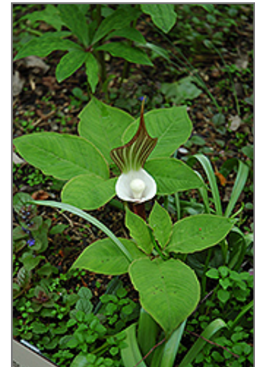
Japanese Jack-In-The-Pulpit in bloom